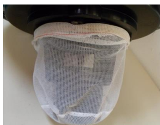
FLT02 WET only filter (optional)