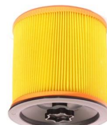
VTSV086 + VTSV087

Only for VT9000 or VTS8000 for WET ONLY use, please order the wet only filter (part number FLT02)