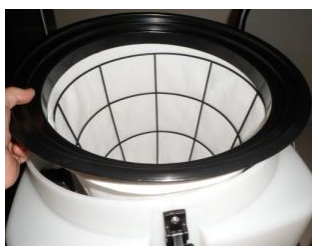
VTVS021 (FIG.21) Dust Screen (wire basket ordered separately)