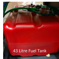
43 Litre Fuel Tank