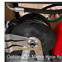
Optional 15 Metre Hose Reel