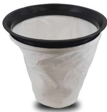
VTVS8021 (FIG.21) Dust Screen