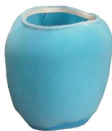
VTVS7020L WET only filter

For WET ONLY use the Machine is supplied with the