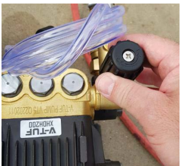
Fig1: Pressure adjustment knob (these may differ in looks) – turn anticlockwise (to low pressure) for starting. This will make it easier to start and also reduce unnecessary wear on your engine pull start mechanism.

When the engine has started turn the pressure adjuster clockwise to increase pressure to suite the task you are undertaking.