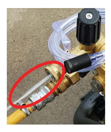
Fig2: High pressure outlet: This is where the high-pressure hose connects.

When the engine has started turn the pressure adjuster clockwise to increase pressure to suite the task you are undertaking.