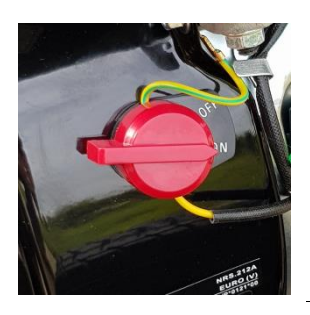
Fig1: Engine on – off switch:

Must be on when starting and switch to off position to stop motor